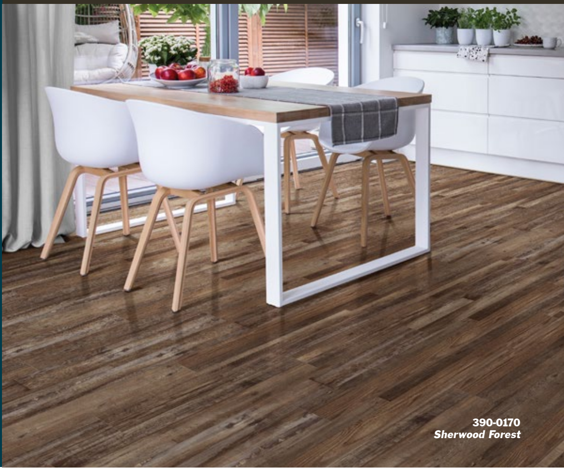
390-0170 Sherwood Forest

Great for kitchens and bathrooms Easy to install – no underlay required VinLoc self locking system UV Coated with aluminum oxide for added scuff resistance IIC 73