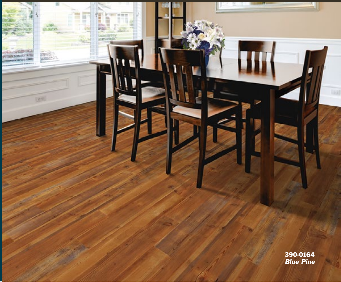
390-0164 Blue Pine

Great for kitchens and bathrooms Easy to install – no underlay required VinLoc self locking system UV Coated with aluminum oxide for added scuff resistance IIC 73